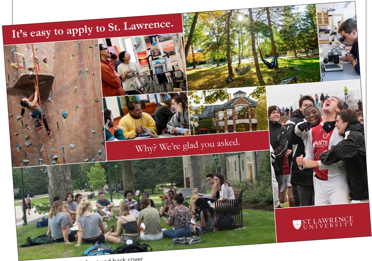
Direct mail folded card: front and back cover