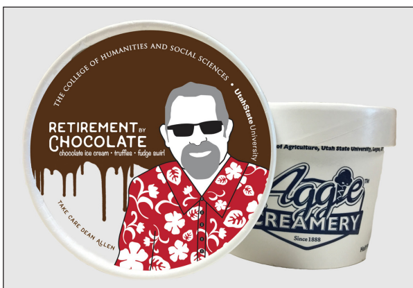
Ice cream topper label